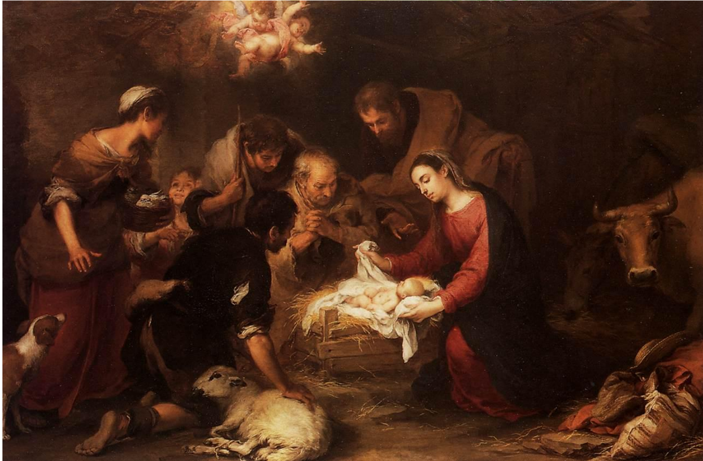
Murillo, Adoration of the Shepherds, c. 1668, Oil on canvas, 147 x 218 cm, Wallace Collection, London