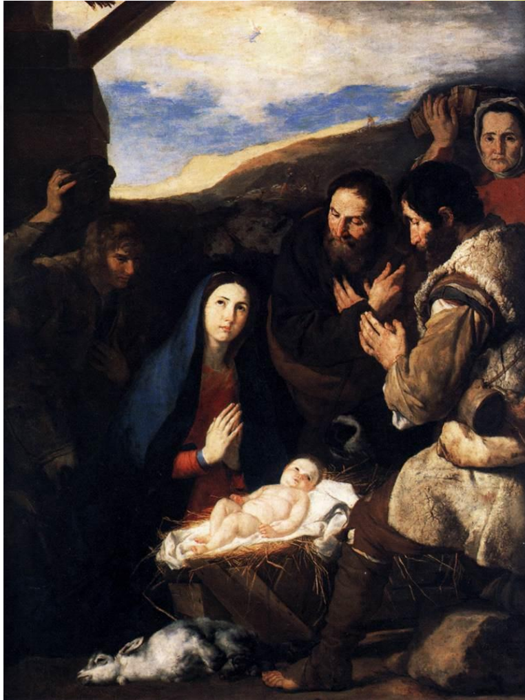
Ribera, Adoration of the Shepherds 1650 Oil on canvas, 239 x 181 cm Musée du Louvre, Paris