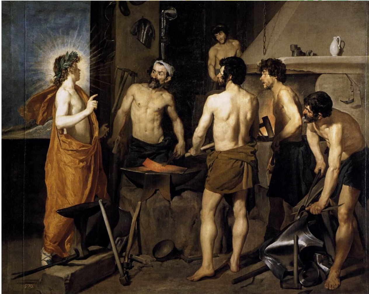
Velasquez, The Forge of Vulcan 1630 Oil on canvas, 223 x 290 cm Museo del Prado, Madrid