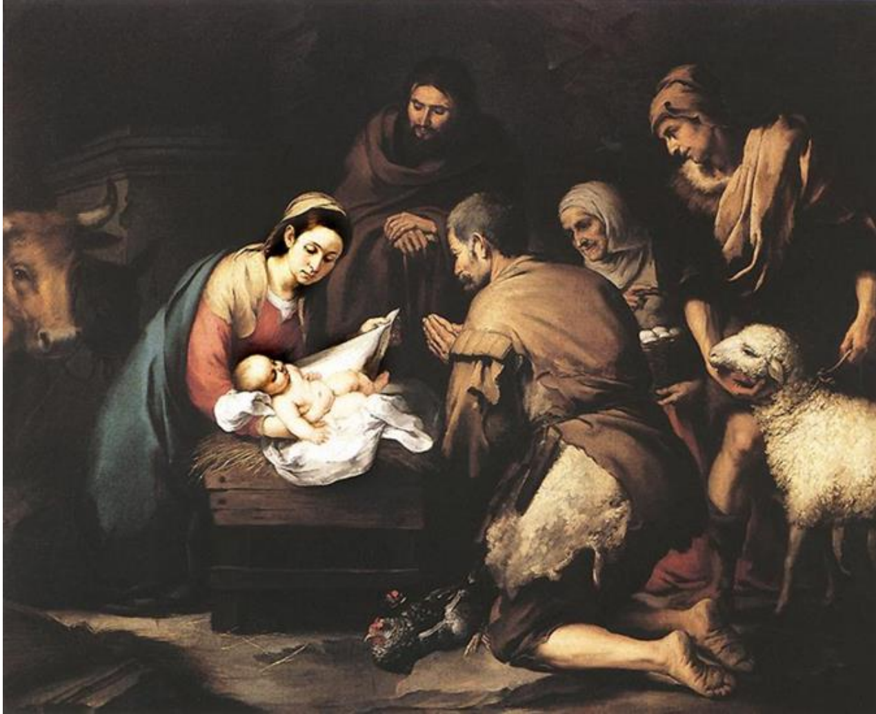
Murillo, "İsa'ya Tapınma", tuval üzerine yağlıboya, 187x288 cm, 1650-55