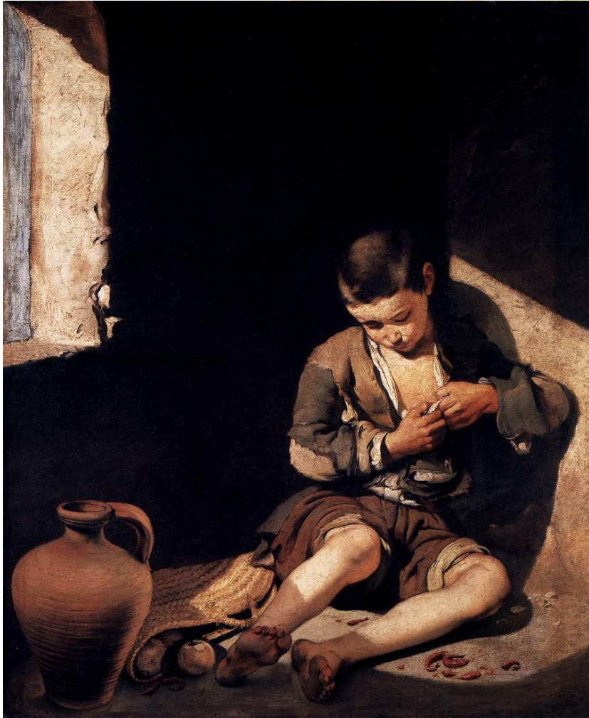
Murillo, The Young Beggar c. 1645 Oil on canvas, 134 x 100 cm Musée du Louvre, Paris