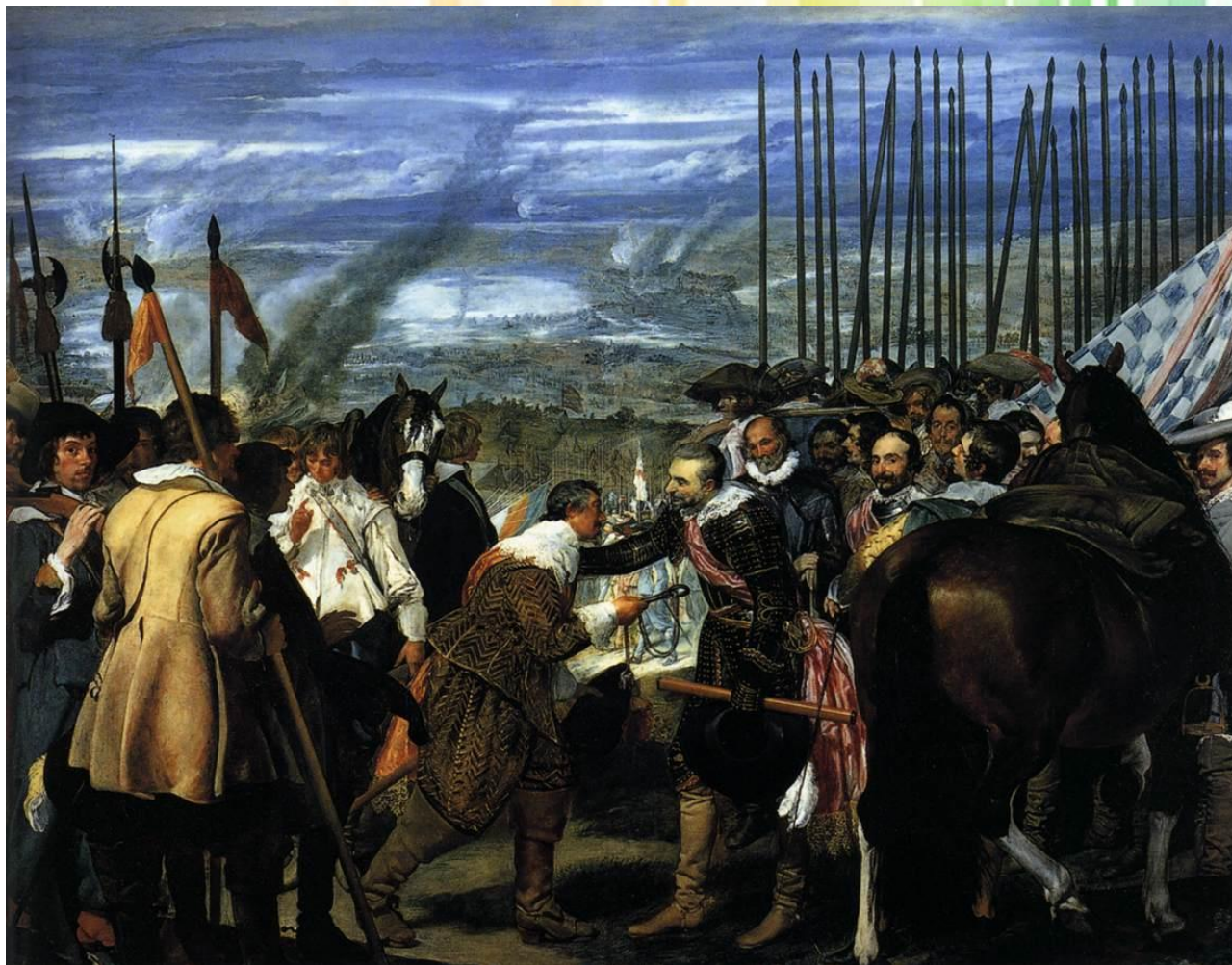
Velasquez, The Surrender of Breda (Las Lanzas) 1634-35 Oil on canvas, 307 x 367 cm Museo del Prado, Madrid