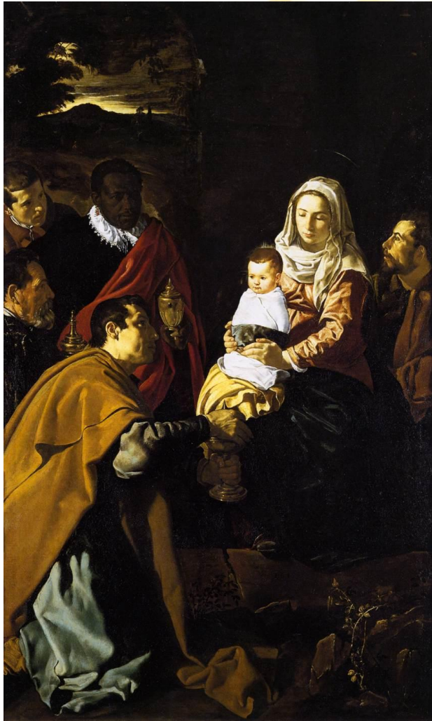
Velasquez, The Adoration of the Magi