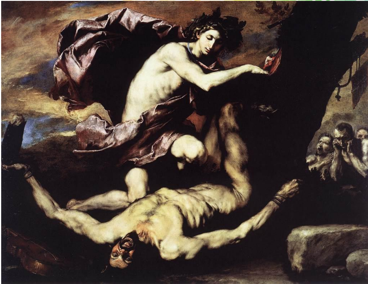
Ribera, Apollo and Marsyas 1637 Oil on canvas, 182 x 232 cm Museo Nazionale di San Martino, Naples