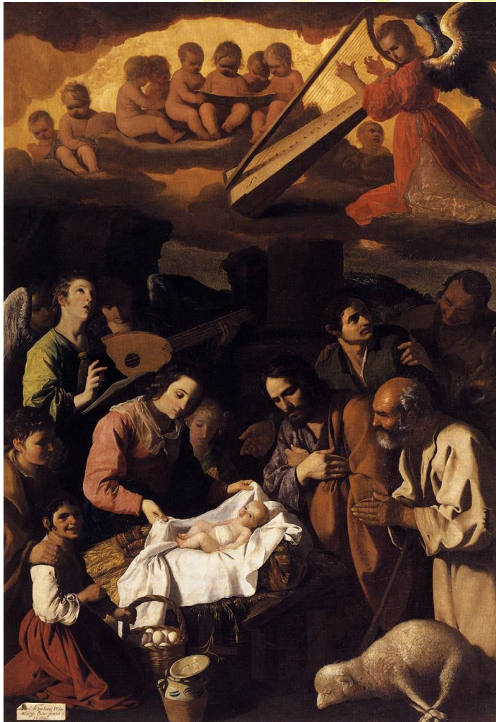
Zurbaran, The Adoration of the Shepherds