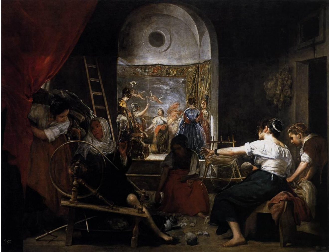
Velasquez, The Fable of Arachne (Las Hilanderas) c. 1657 Oil on canvas, 220 x 289 cm Museo del Prado, Madrid