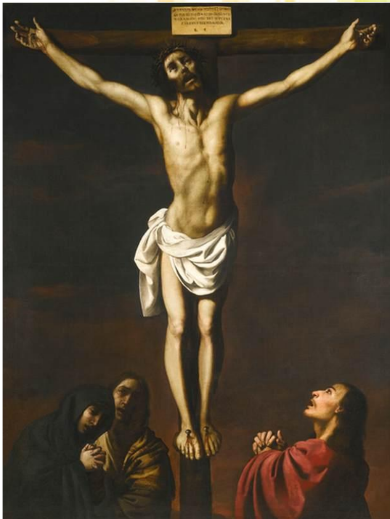
Zurbarán, Christ on the Cross 1655 Oil on canvas, 212 x 163 cm Private collection