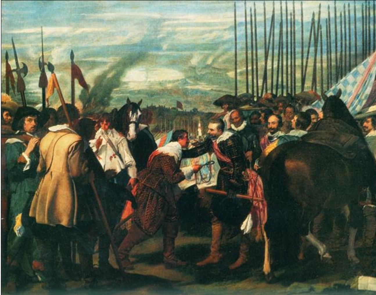
Velazquez, "Breda'nın Kuşatılması", tuval üzerine yağlıboya, 307 x 367 cm, 1634-35