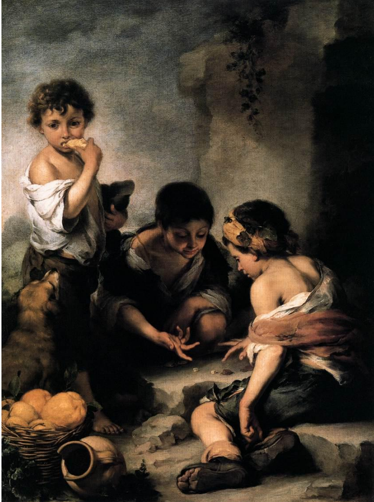
Murillo, Zar oynayan genç çocuklar c. 1675 Oil on canvas, 145 x 108 cm Alte Pinakothek, Munich