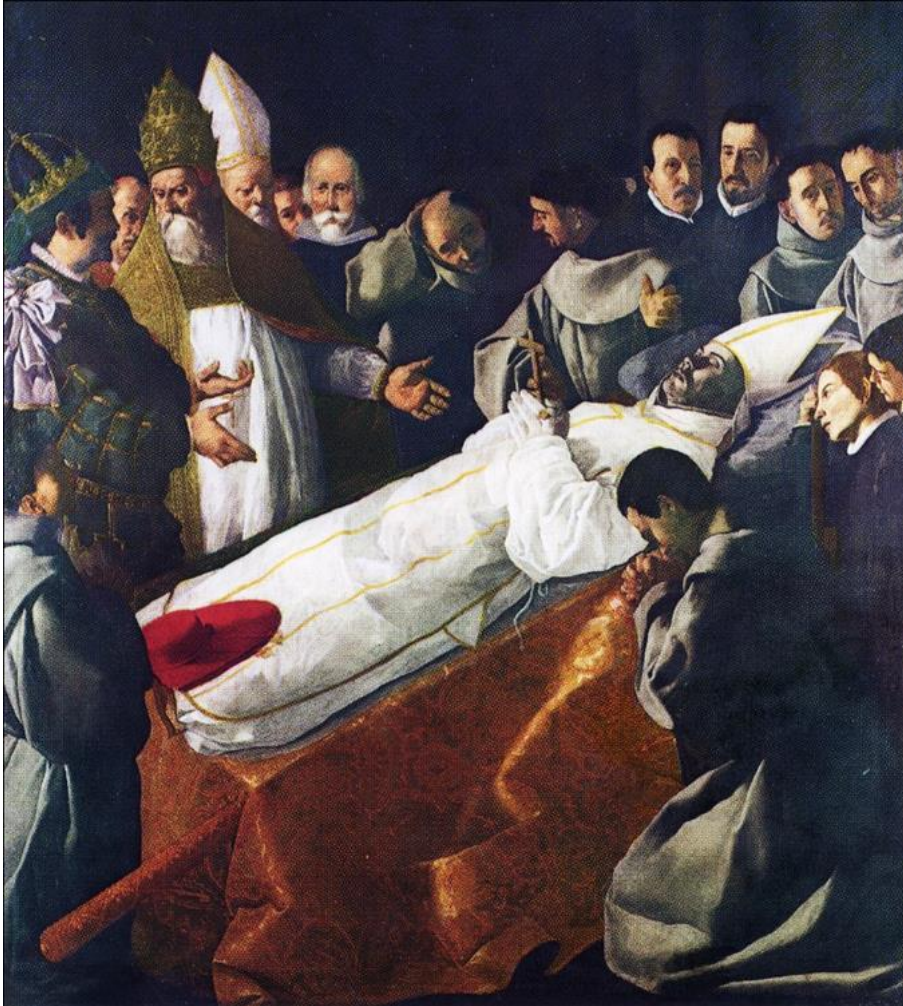
Zurbarán, “Aziz Bonaventura’nın Ölümü”, tuval üzerine yağlıboya, 250 x 225 cm, 1629