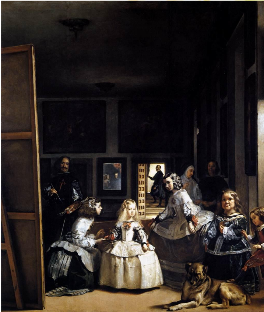
Velasquez, Las Meninas or The Family of Philip IV 1656-57 Oil on canvas, 318 x 276 cm Museo del Prado, Madrid