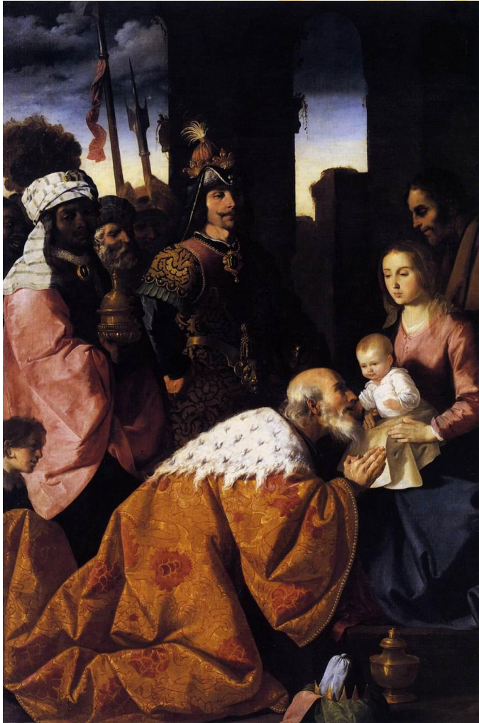
Zurbarán, Adoration of the Magi 1639-40 Oil on canvas, 264 x 176 cm Musée des Beaux-Arts, Grenoble