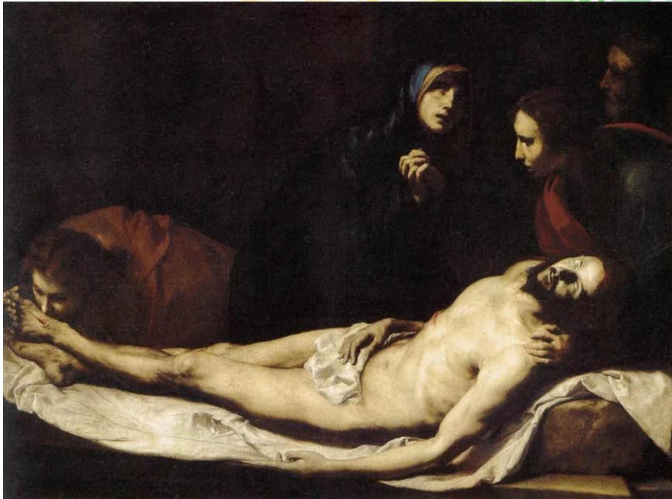
Ribera, The Lamentation 1633 Oil on canvas, 157 x 210 cm Museo Thyssen- Bornemisza, Madrid