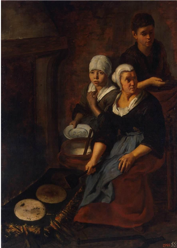
Murillo, Ekmek Pişirenler 1645-50 Oil on canvas, 165 x 121 cm The Hermitage, St. Petersburg